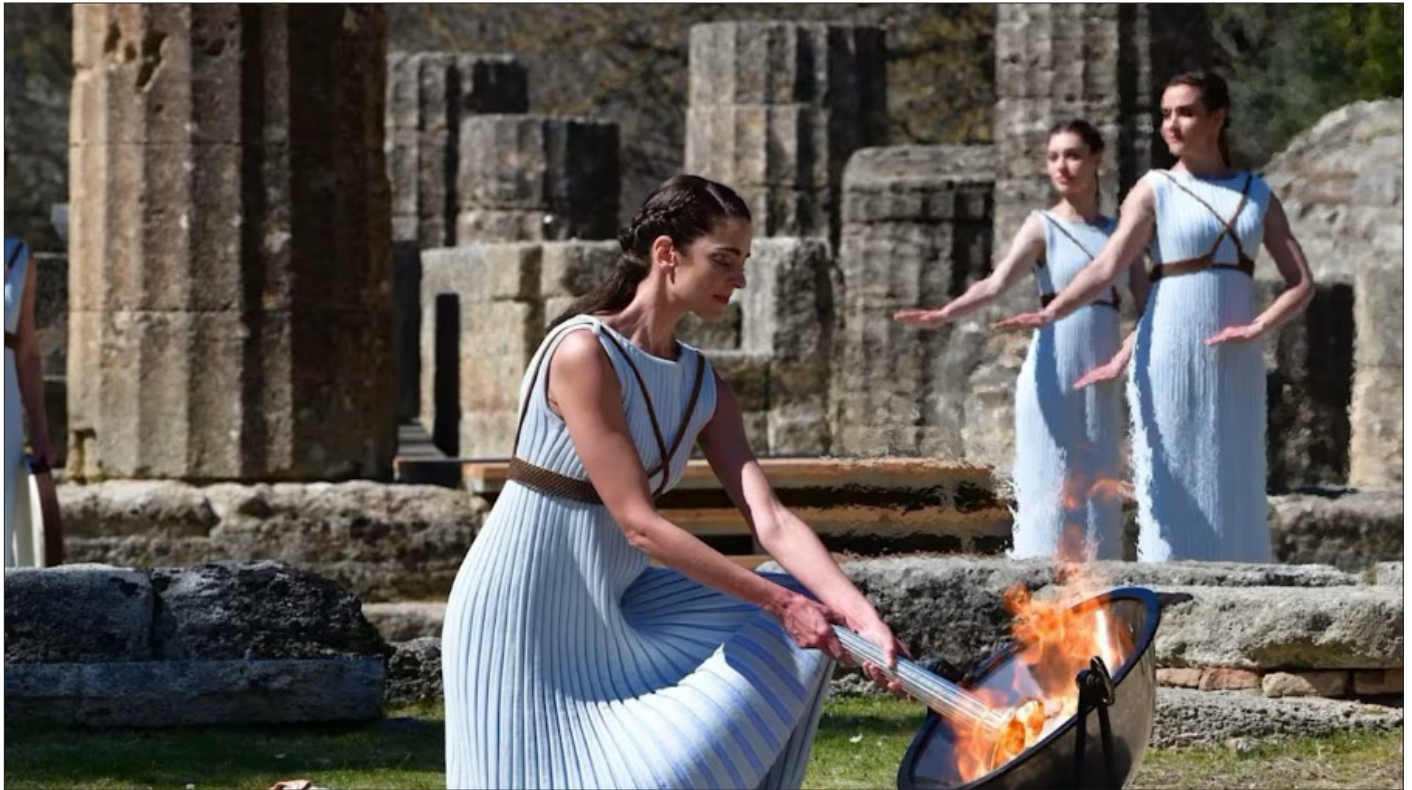
An athlete in Olympia dressed in classical costume lights the torch with the Olympic flame.

According to the official calendar, the Olympic Games took place for the first time in 776 BC in the Greek city of Olympia in the north-west of the Peloponnese – 3,000 years ago. The simple rural festival in Greek Olympia, which the inhabitants celebrated in honour of Zeus , became a competition in song, dance, poetry and many sporting disciplines. The period between two festivals (four years) was called an Olympiad. These games brought together the best artists and athletes from all over the Greek peninsula and the islands. The Olympic Games have a long tradition – even after the fall of Ancient Greece. The basic idea has survived. Since ancient times, the Olympic flame has remained a symbol of peace and friendship between peoples.