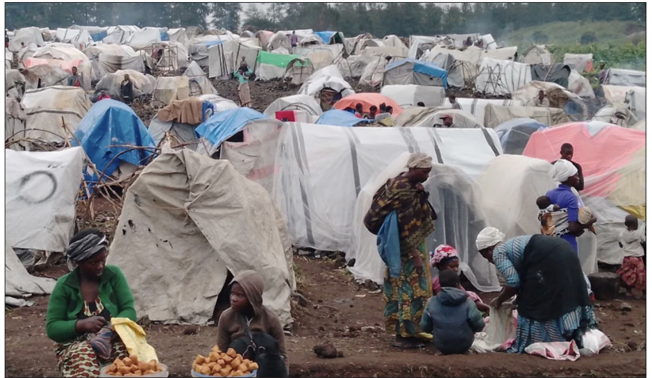
Refugee camp in the east of the Democratic Republic of the Congo. Several million people are refugees in their own country.

But there is one thing all these groups have in common, despite their often-poetic names which contain a lot of democracy, freedom and the like (but never peace!): cynical, sadistic and obviously purposeful cruelty aimed at the unarmed villages in the hills and their civilian populations. It entails the systematic annihilation of entire settlements and villages, often combined with slaughtering of the men, mass rapes of the women and killing