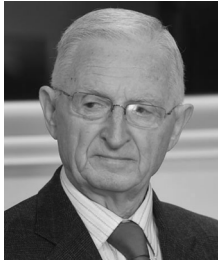
Živadin Jovanović

Interview with Zivadin Jovanovic, President of the Belgrade Forum for a World of Equals